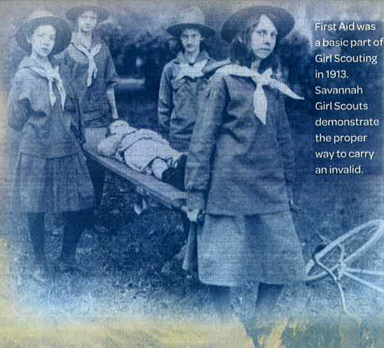
First Aid was a basic part of Girl Scouting in 1913. Savannah Girl Scouts demonstrate the proper way to carry an invalid.