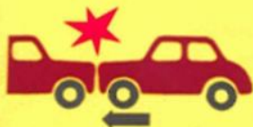
Forward collision warning