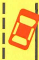
Lane departure warning