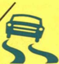
Electronic stability control